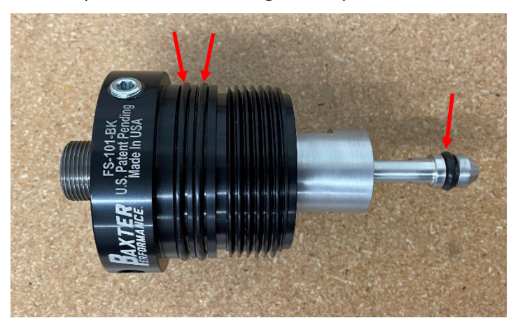
Step 5: Install O-rings on adapter body and tip, lubricate all O-rings with oil. Reinstall adapter and torque to 40 ft.lbs. using 1" Deep Socket.