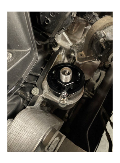
Step 7: Install schrader valve.