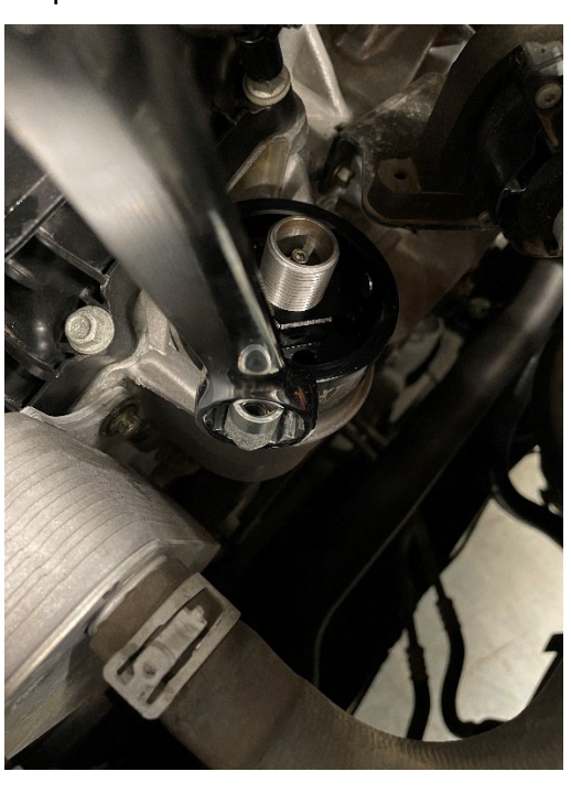
Step 6: Lubricate threads with oil and install 90° fitting (if using) with 15/16" 12-point wrench.